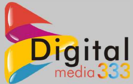
Digital Media 333 / Avvatta