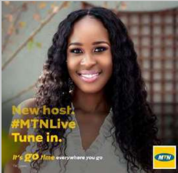
MTN South Africa